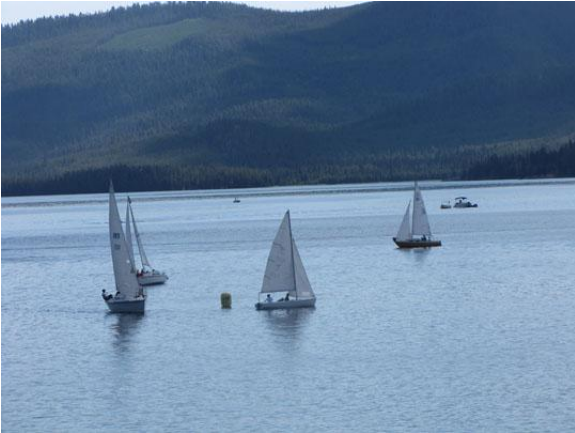
The first mark rounding