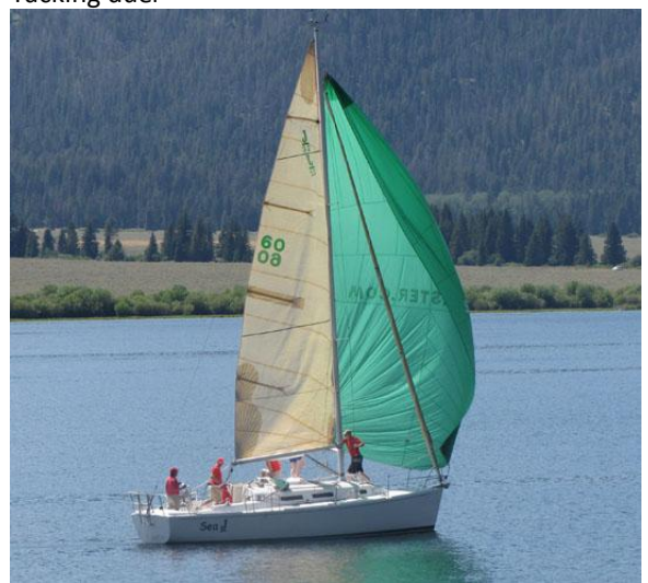
Sea-J Spinnaker Run