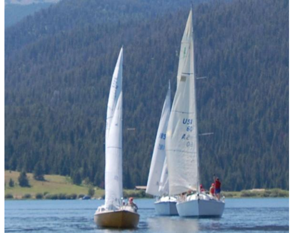
A tight start